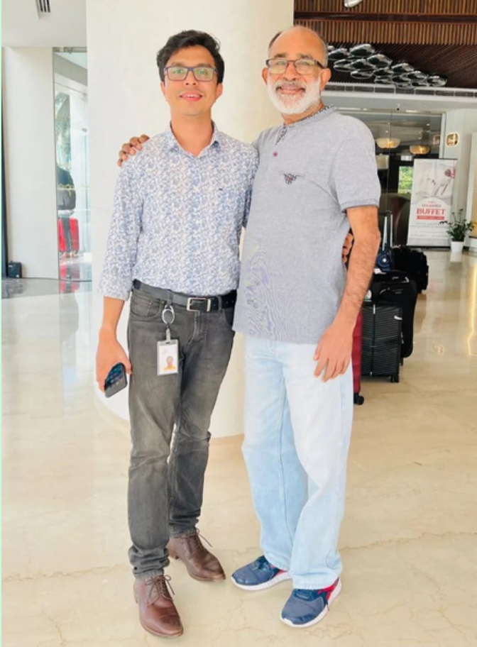
With Alphons Kannanthanam, Former Union Minister Of Tourism, India