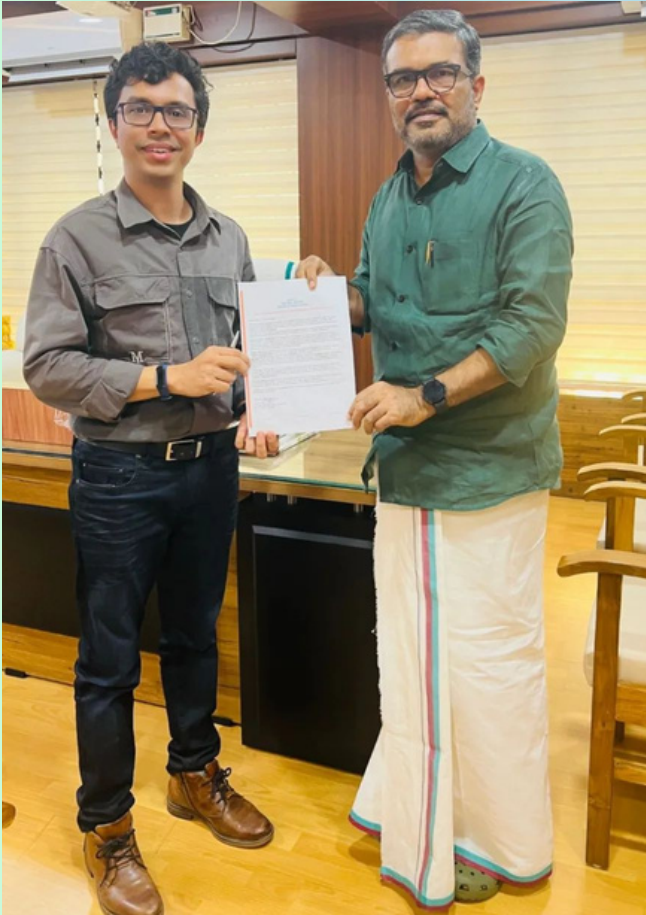
With M.B Rajesh Minister of LSGD & Excise, Kerala